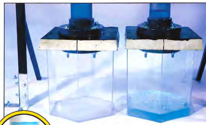
WATCHDOG H3 No Leaks! Competitive Product Leaks at less than 12" HH.

Membrane elongates to span a shrinkage crack, and effectively resists hydrostatic pressure.