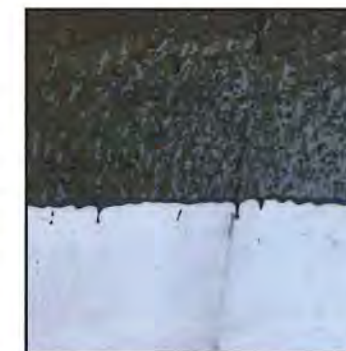
WATCHDOG H3 hangs tough!

With little hang strength, the sagging competitor can't deliver the minimum code-required 40 mils of cured membrane. Equally important, that thin membrane cannot deliver any of their minimal published performance specifications.